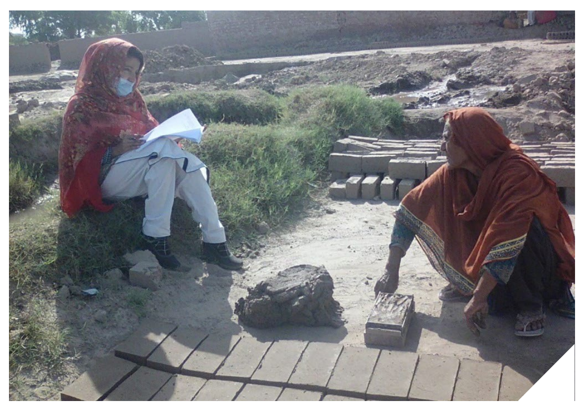
A brick kiln worker with a child in Pakistan.

Interviews with 53 brick kiln owners from all four Pakistani provinces indicate that most owners oppose the practice of monetary advances. However, they continue providing advances as they believe they have no other alternative for securing their work force. While kiln owners are largely in favour of social security for brick kiln workers, they criticize the mechanism for fixing the minimum wage. In Punjab, different categories of brick kiln workers are entitled to the same minimum wage rate despite regional variations in the costs of brick-making, as well as the price and quality of bricks.